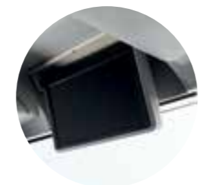
Audio & video entertainment system

Choose from TEMSA's range of optional equipment to further improve your vehicle's comfort and performance levels. Whatever you need to enhance your vehicle's efficiency, we can offer you the equipment that makes all the difference.