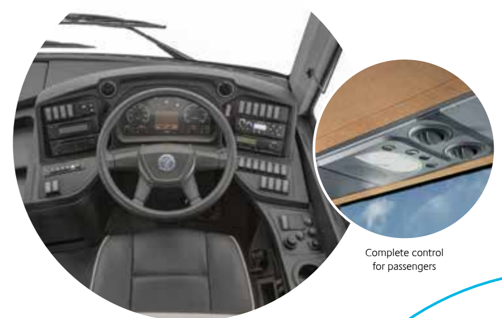
Comfortable driver's area