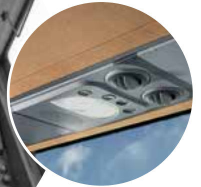
Complete control for passengers