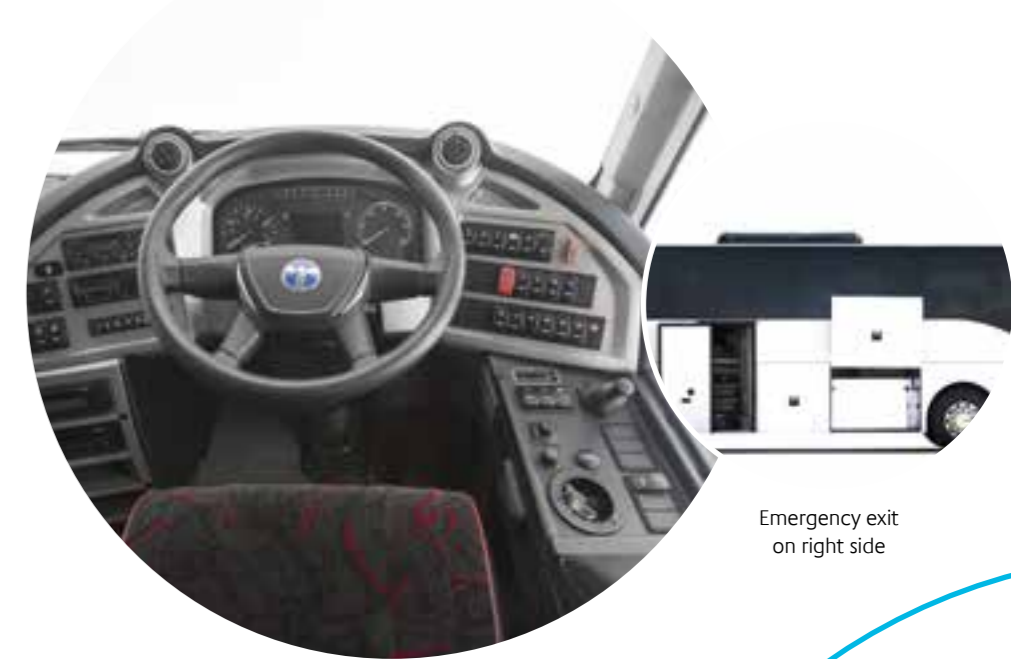
Ergonomic driver's area