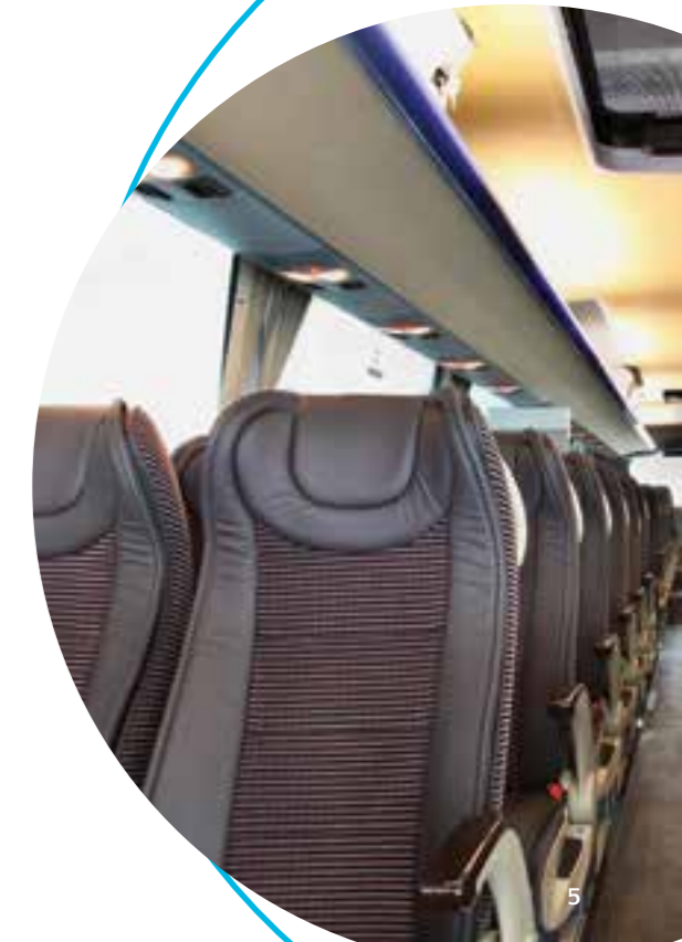
High quality interior