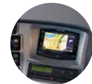
GPS navigation system