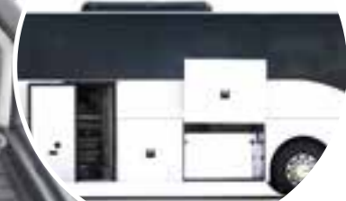
Emergency exit on right side